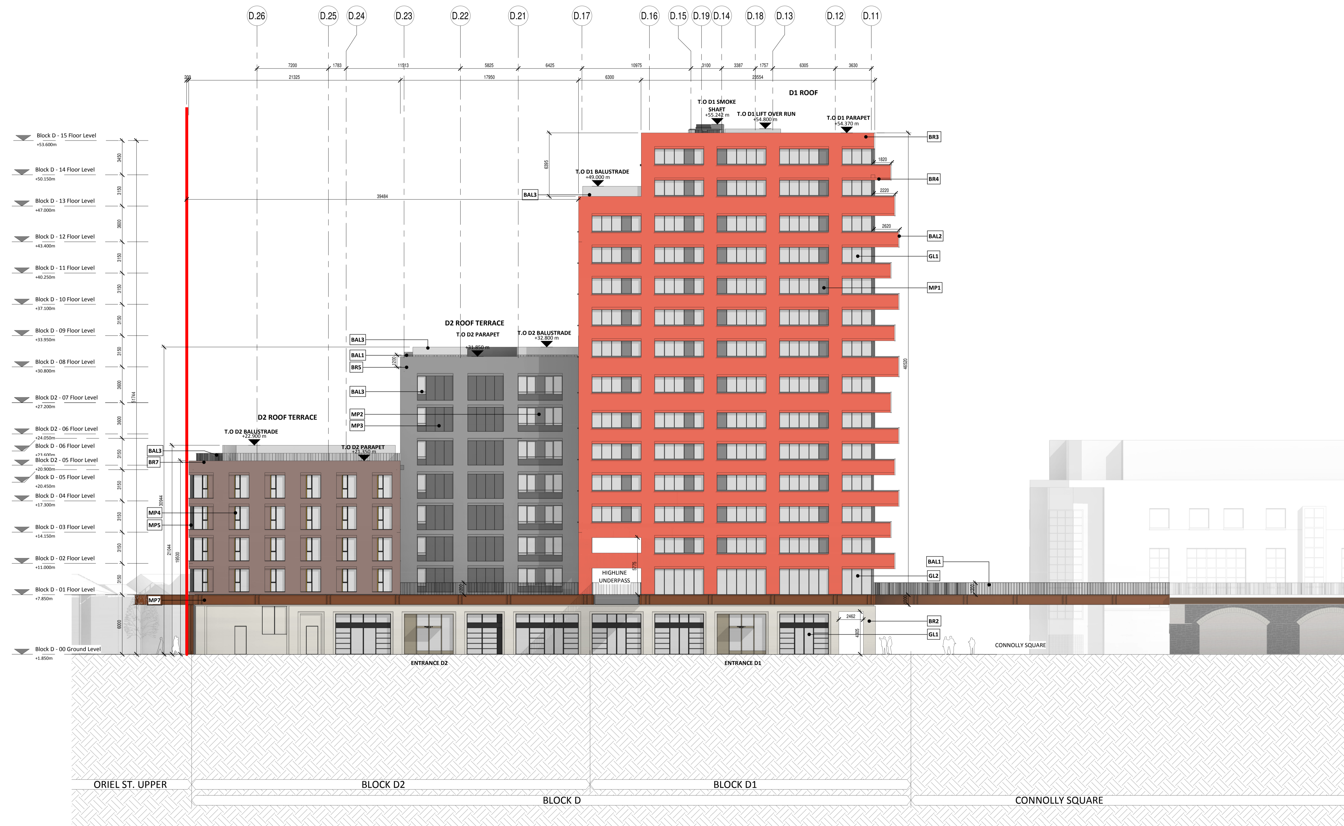
1 BLOCK D - NORTH ELEVATION 1 : 200